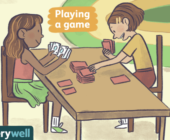
Playing a game