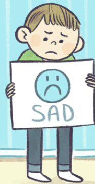
Label the feeling